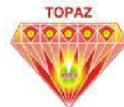
Topaz Multi Industries SA Republic of Guinea