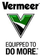
Vermeer West Africa