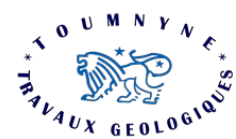
Toumnyne SARL, Republic of Guinea